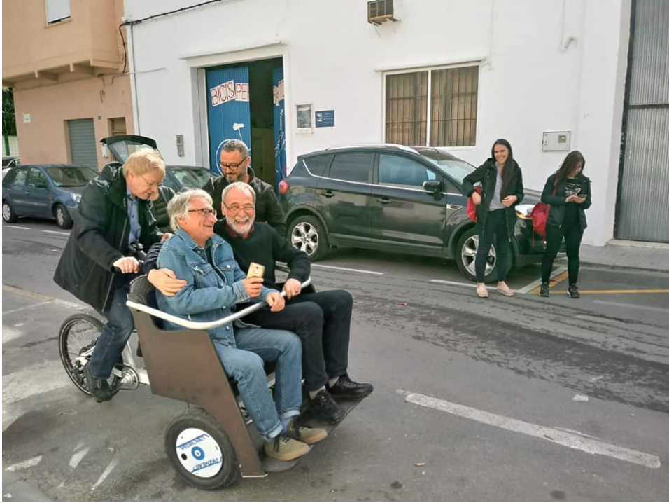
Trying a bicycle for persons with disabilities