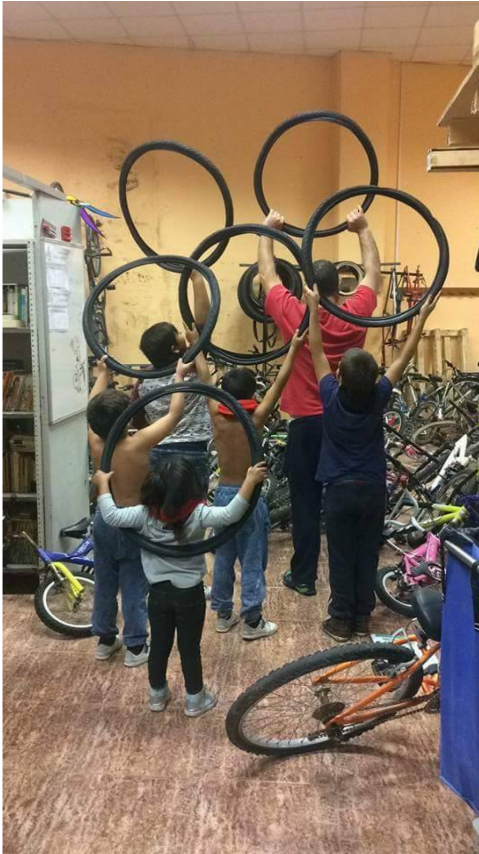
The premises and activities with children