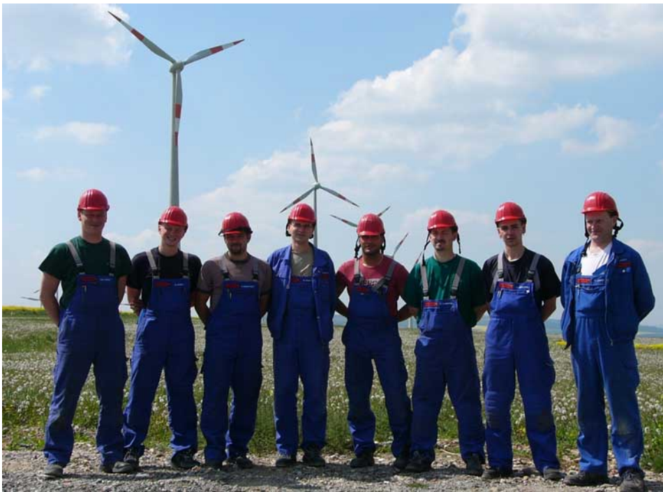
Wind power creates jobs. 4,000 new jobs in Magdeburg wind power production and 8 maintenance specialists