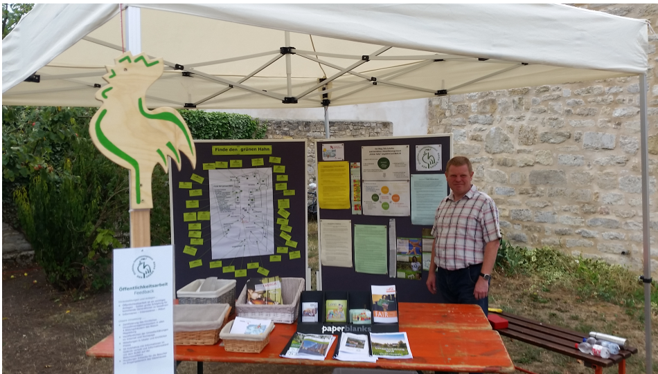
Public relations work at the diocese pilgrimage