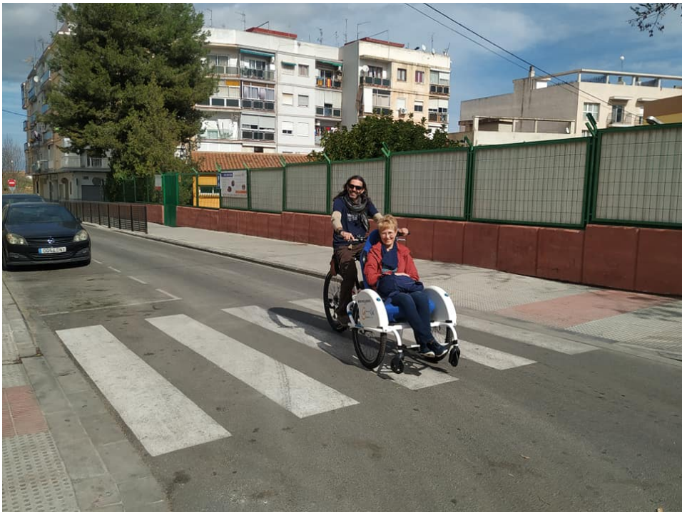
Trying a bicycle for a person with disabilities