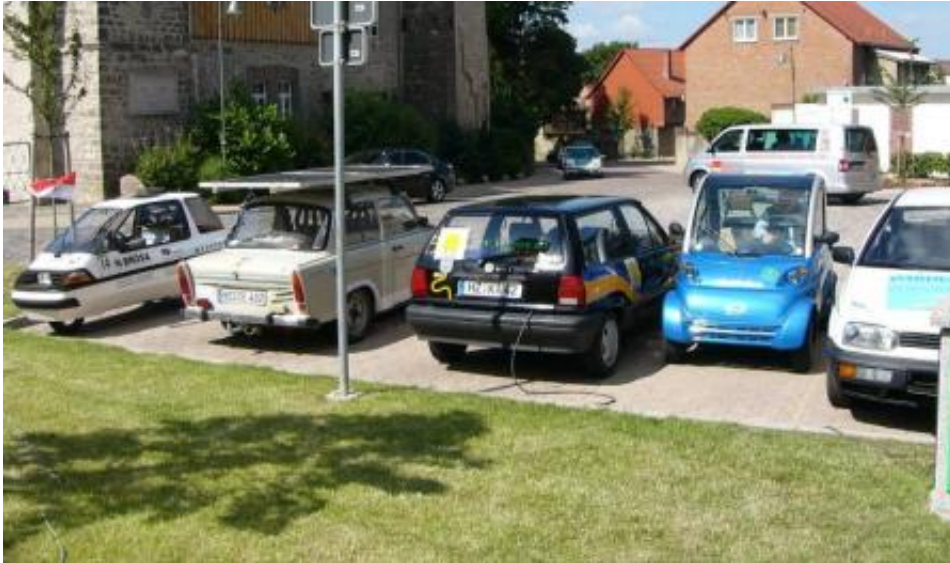
Here is the state of the art of the electric vehicles that initially visited the charging station!