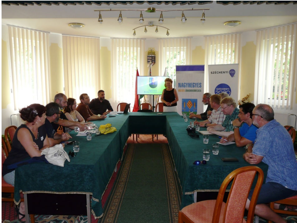
The mayor of Nagyhegyes presenting the developments of the town in the building of Town Hall