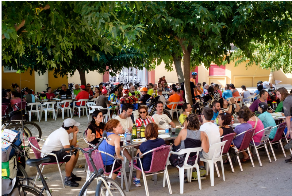
Participants and supporters who accompanied them for the first day, having lunch.