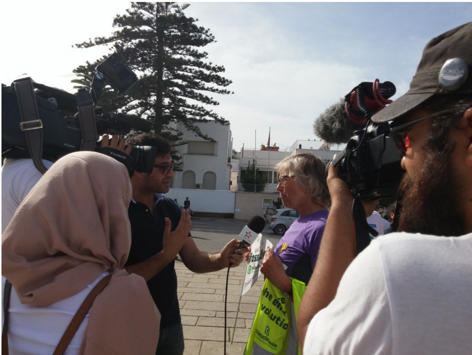
Media work in Morocco