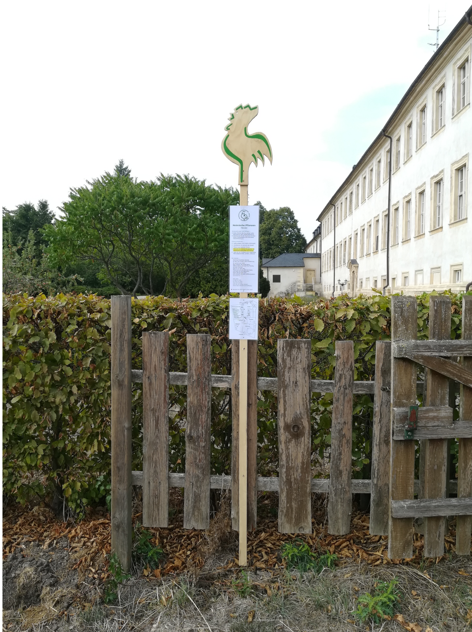
The Green Rooster in the garden of the Huysburg monastery