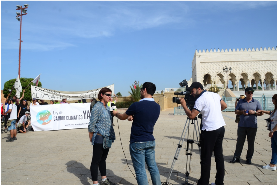
Media work in Marrakech