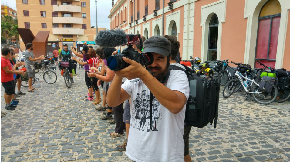
Day 1, shooting