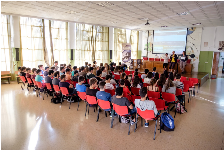
Conference and debate with school children on the way to Marrakech