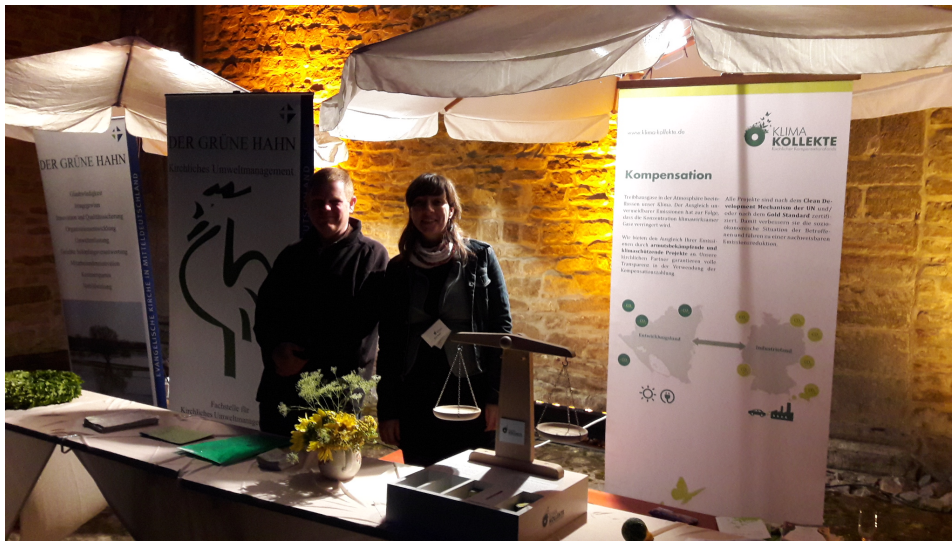
Cooperation with the organisation Klimakollekte