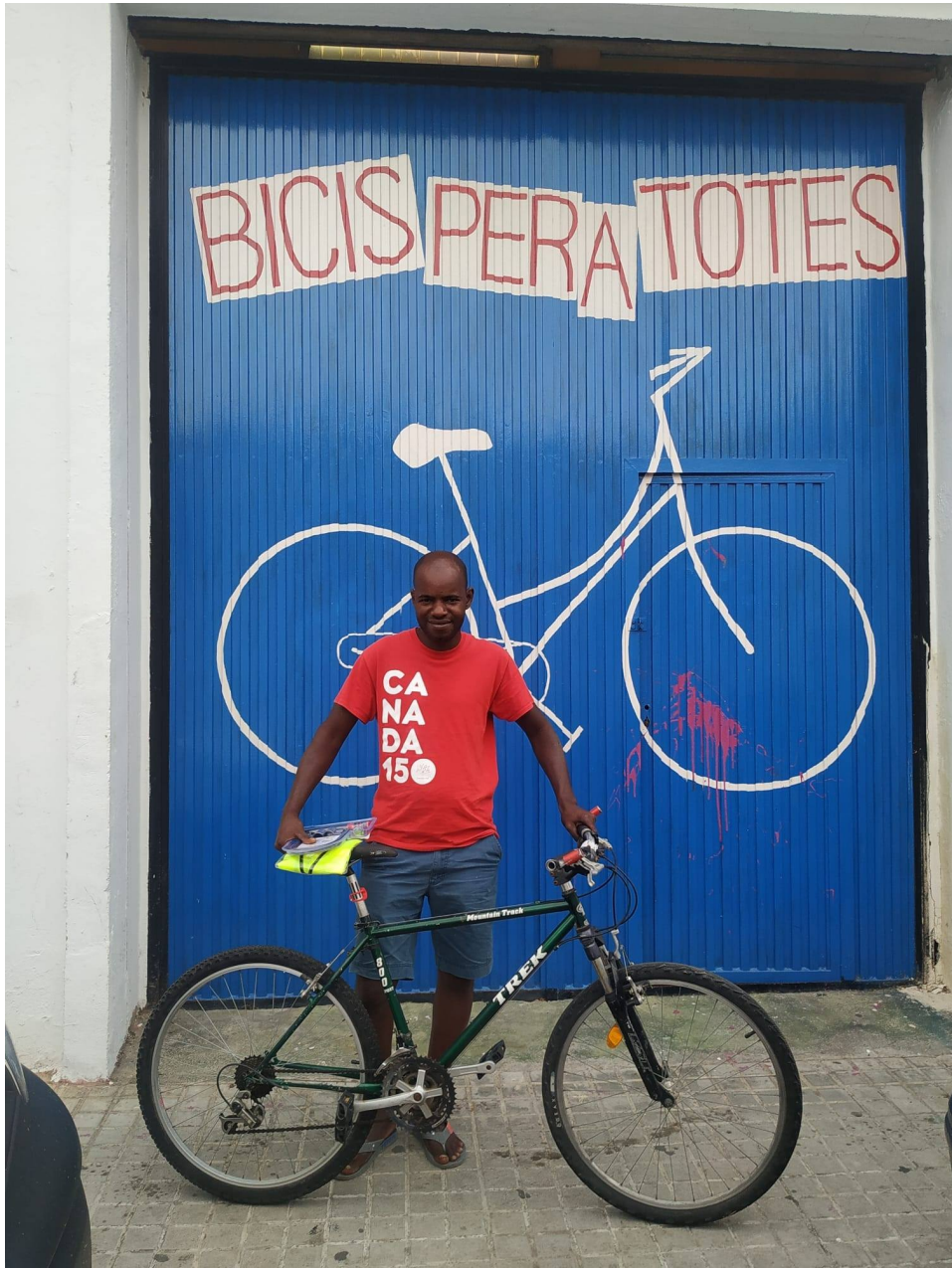
Bicycle and kit for an adult