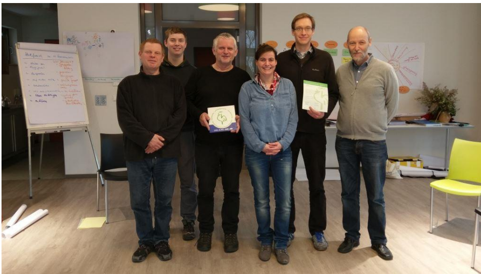
Certification with the Green Rooster in the family holiday hostel St. Ursula in Kirchmöser