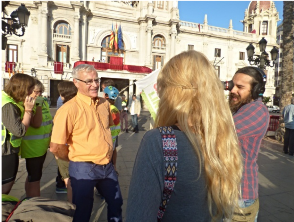
Valencia's mayor, departure day to Marrakech