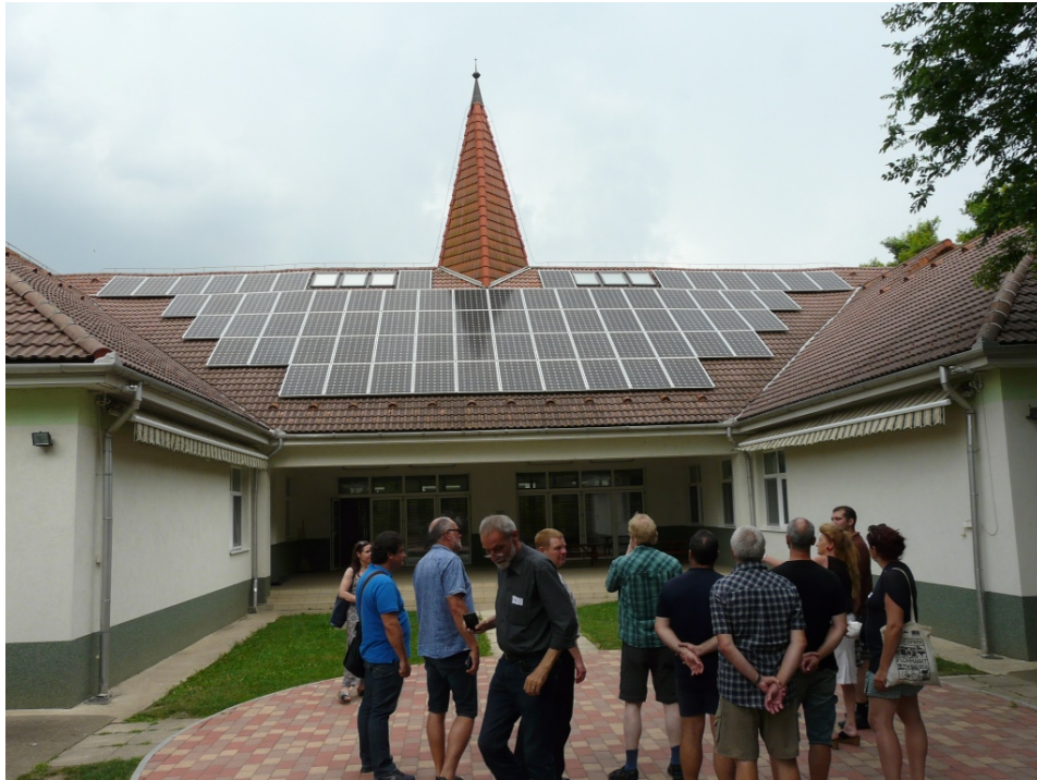
PV panels on the building of the kindergarten in Nagyhegyes

were replaced and it was insulated as well. The building of the Sport Complex was insulated, and its old heating system and old doors and windows were replaced.