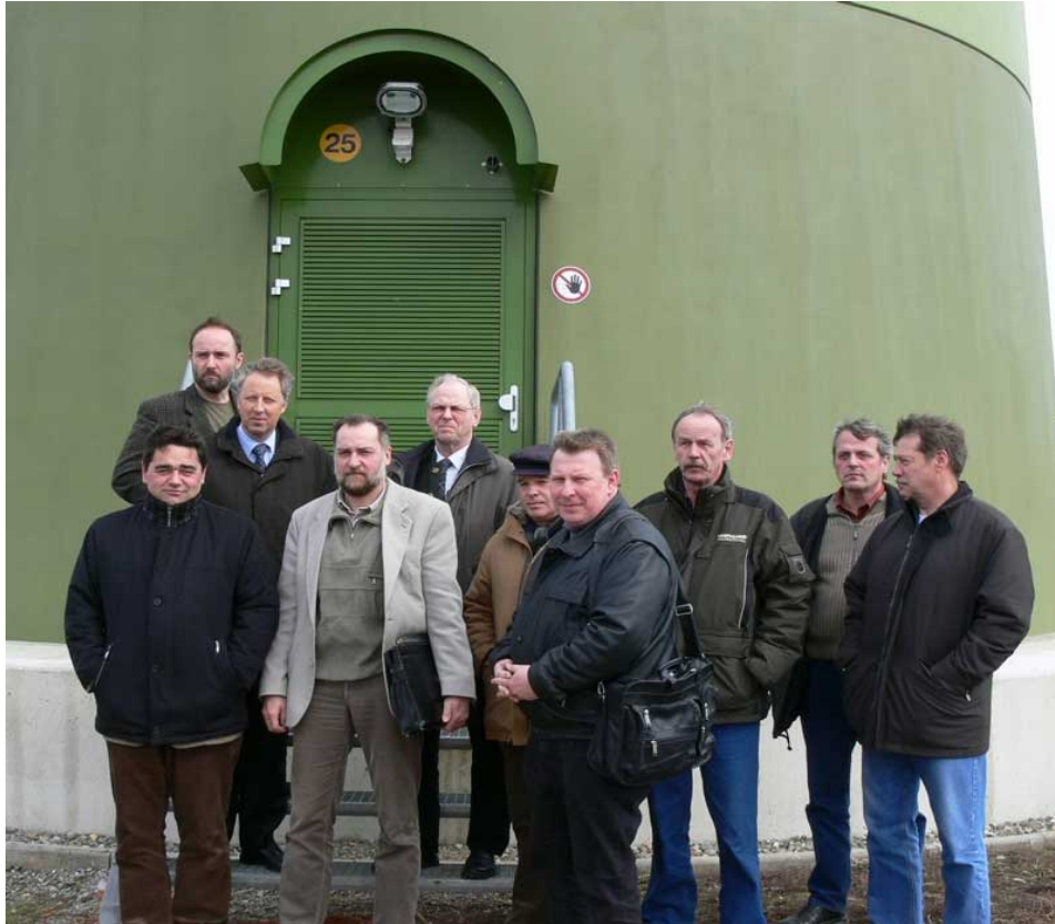
A delegation of regional politicians, district administrators and local parliamentarians visits the Druiberg wind farm