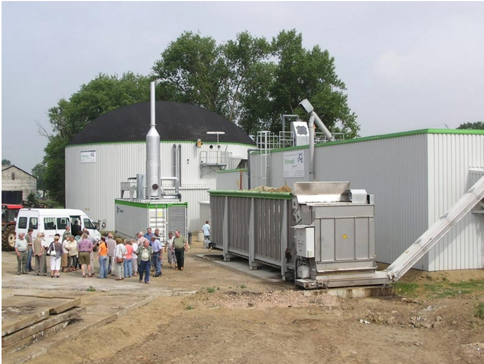
Biogas generation in Zilly with Jenbacher gas engine (complete system built by Schmack) for electricity and heat generation.

Zilly / Dardesheim eG put the first larger biogas plant in the region into operation. It now mainly uses maize and thus generates 500 kW of reliable electrical power. Almost ten years later, the overall efficiency of the system was significantly improved by laying and connecting a heat pipe for heating the castle with the kindergarten. For a long time in Germany, biogas plants were installed by farmers who saw little opportunity to supply heat to their village center with high losses. Only a few operators came up with the idea of transporting the generated, dry and cool biogas virtually loss-free to where there was more heat demand via combined heat and power, mostly in a central location.