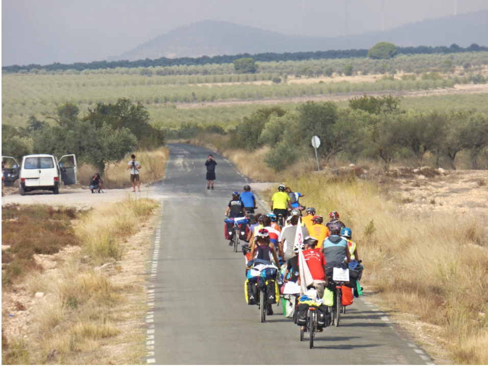
On the road