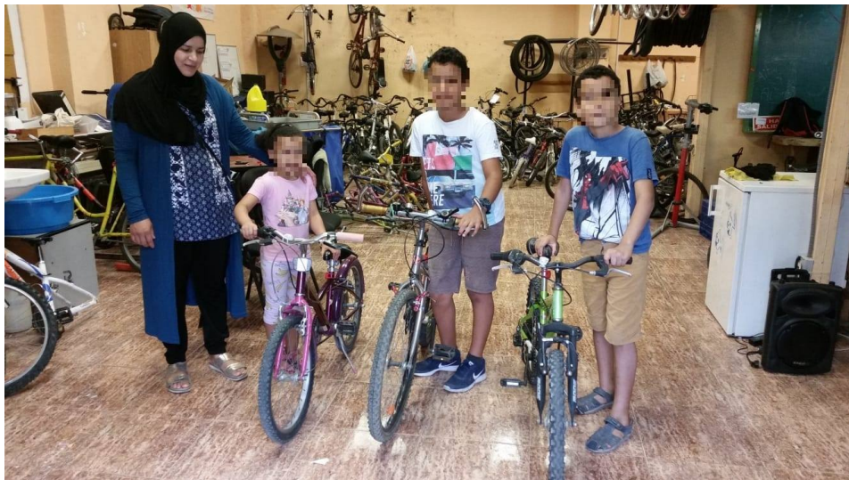
Bicycles for children