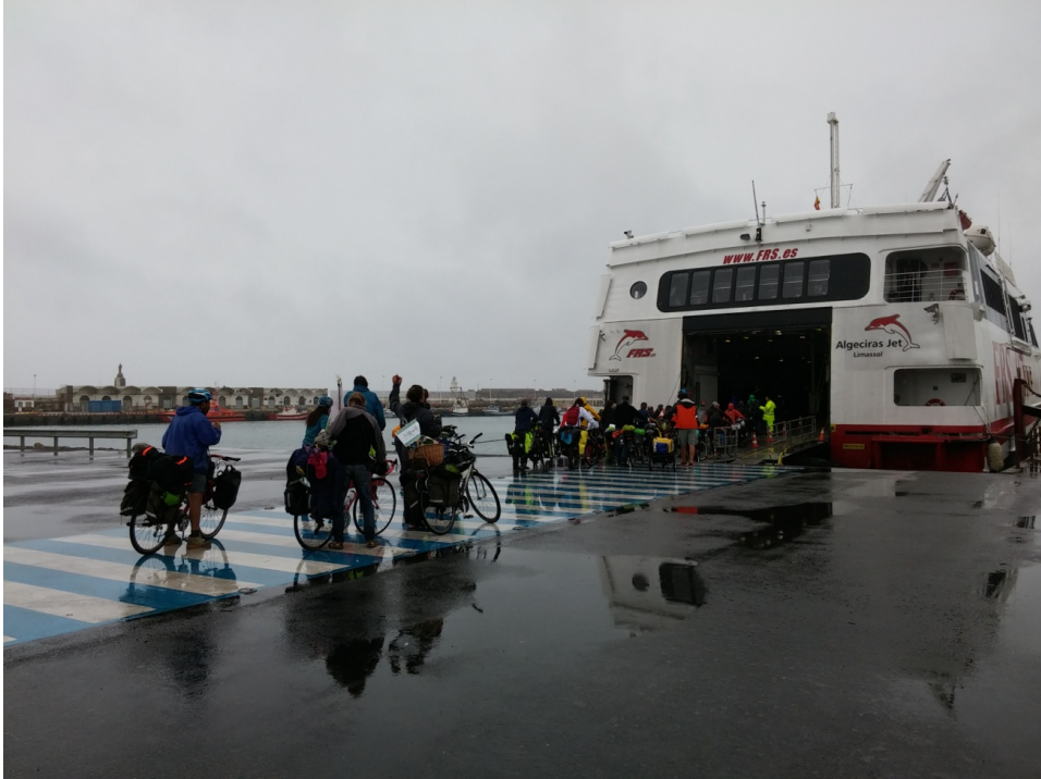
On the ferry to Tangier