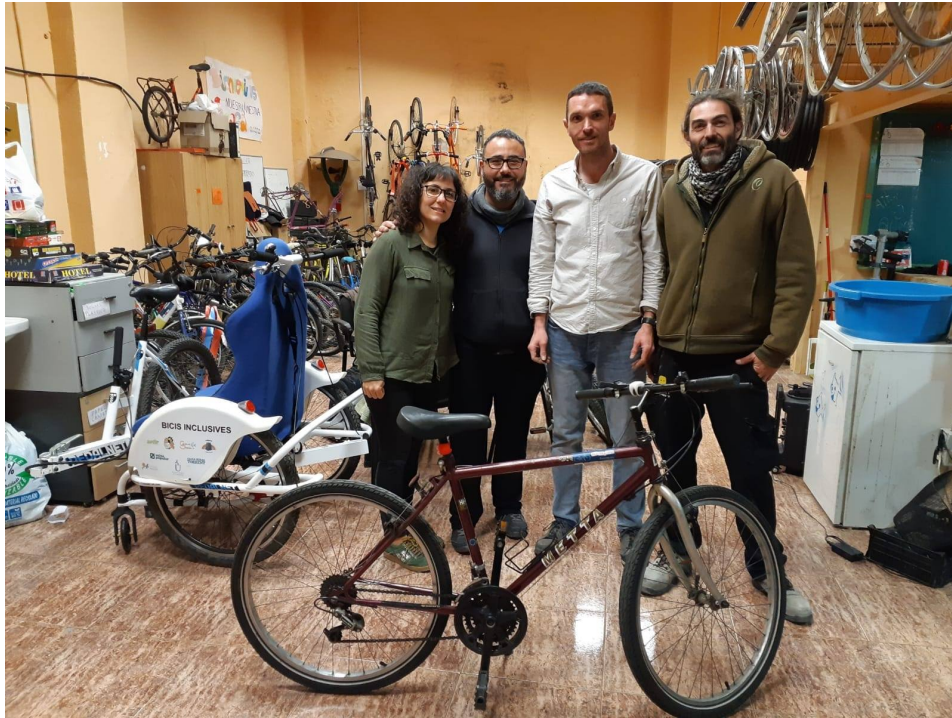
Bicycle for an adult