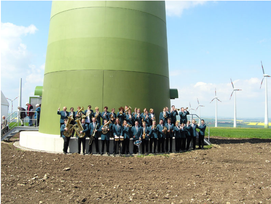
The Dardesheim City Orchestra at the base of a wind turbine

With the strategies we presented above, we have succeeded in generating acceptance for renewable energies, with a focus on wind energy, among the citizens of Dardesheim and the surrounding area. For our children, the existing wind farm and the use of other renewable energies are a matter of course on the way to the urgently needed energy transition.