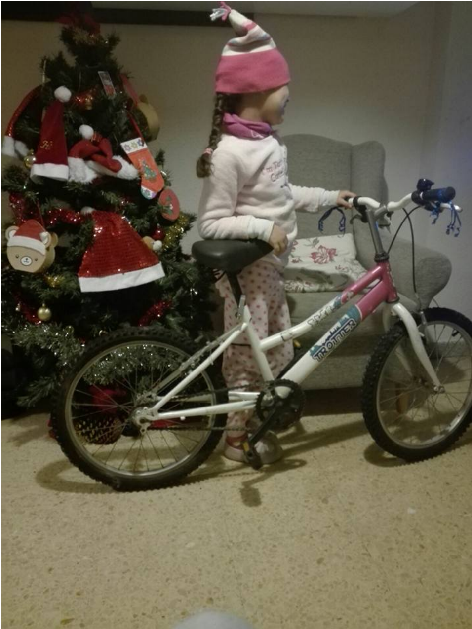
Bicycle for a child