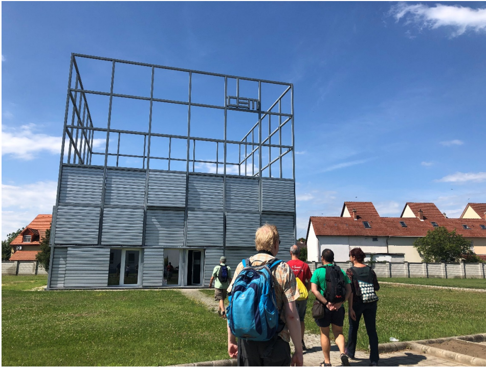
Passive house: Information centre for sustainable building energy at University of Debrecen ? outside view