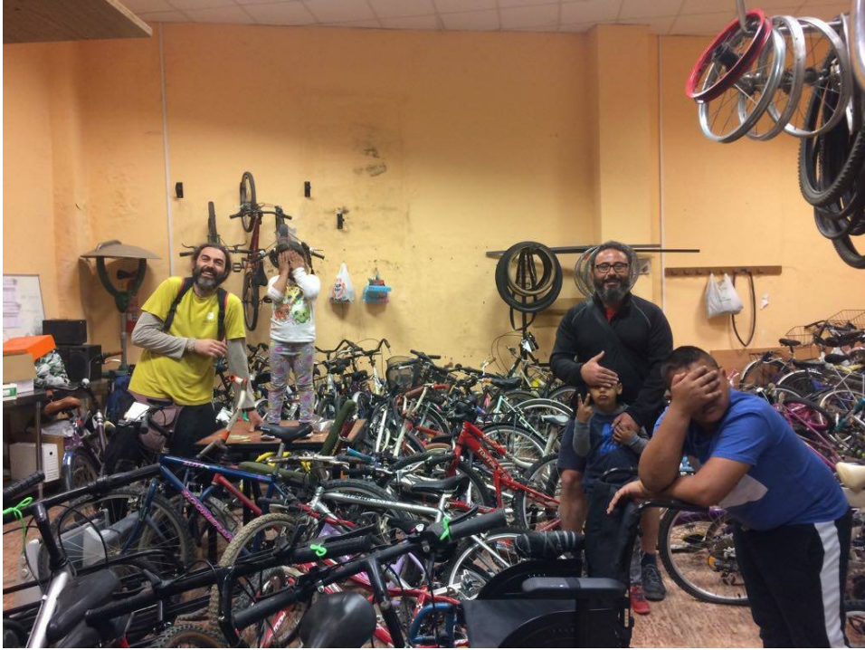
The premises, members of the team and children