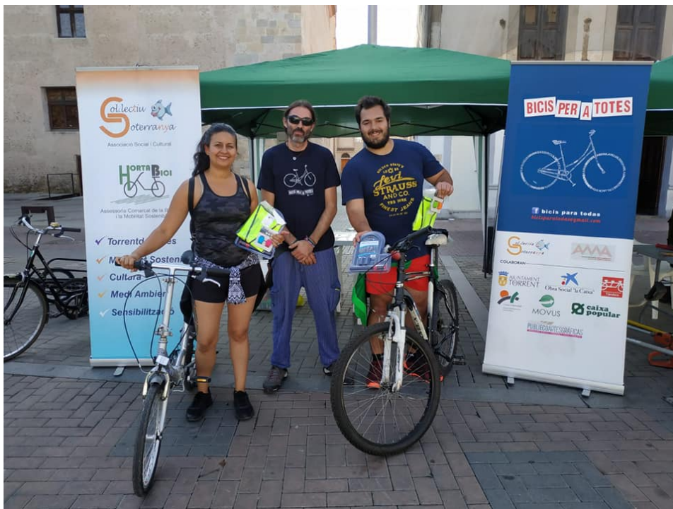
Bicycles and kits for adults