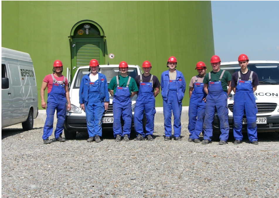
Enercon service team in 2006 in front of the tower of the E 112 with a nominal output of 6 MW.