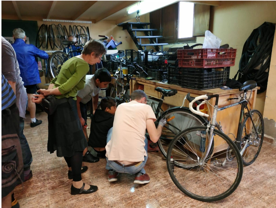
Workshop, fixing bicycles