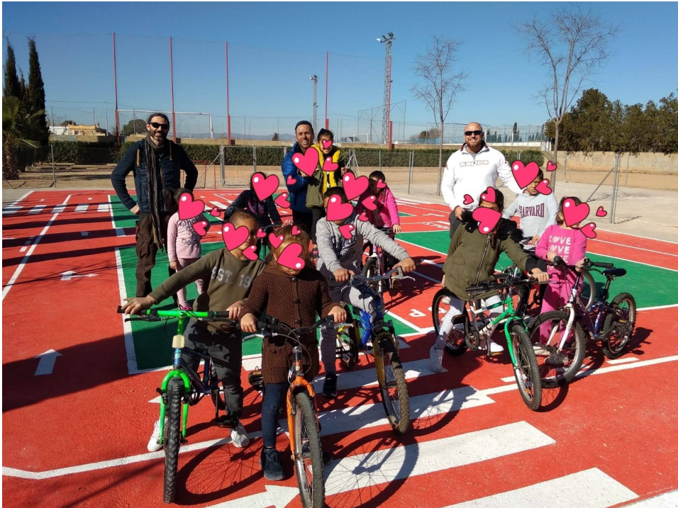
Activities with children