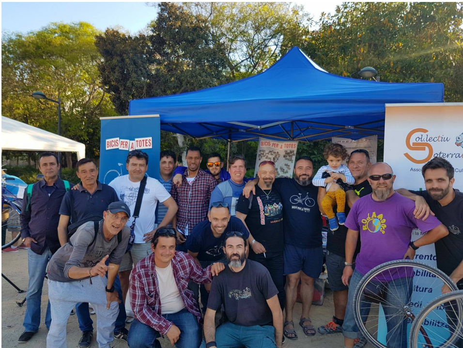
Volunteers and supporters