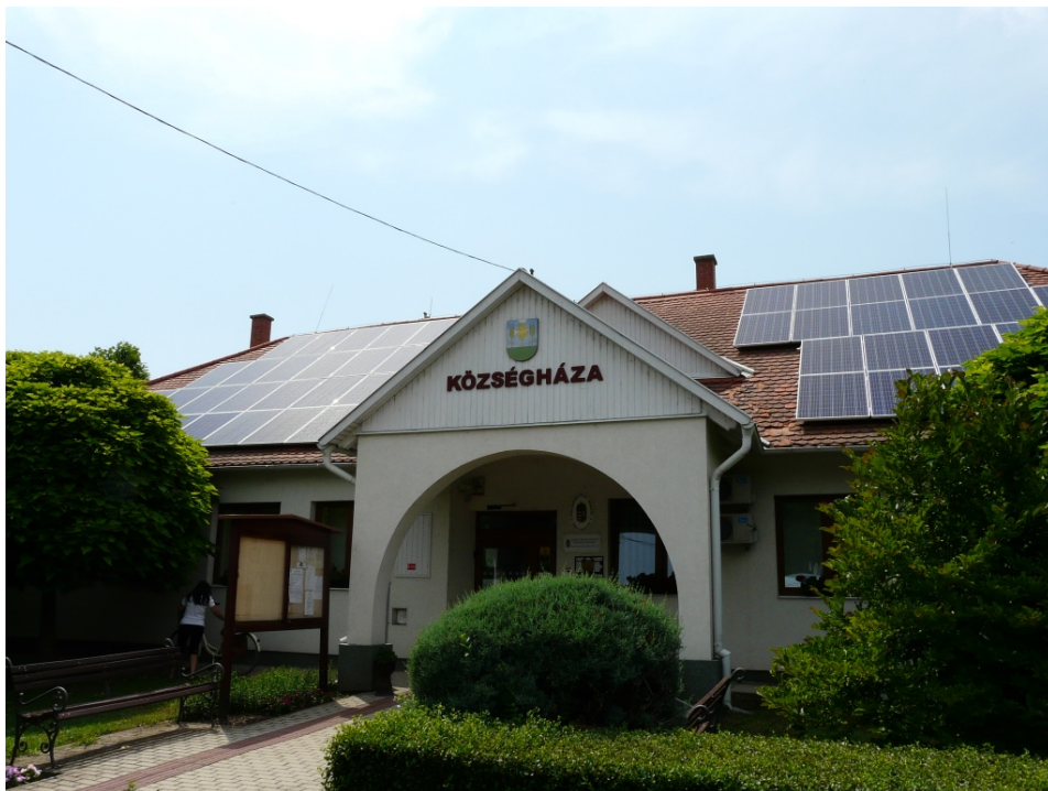
PV panels on the building of the Town Hall in Nagyhegyes