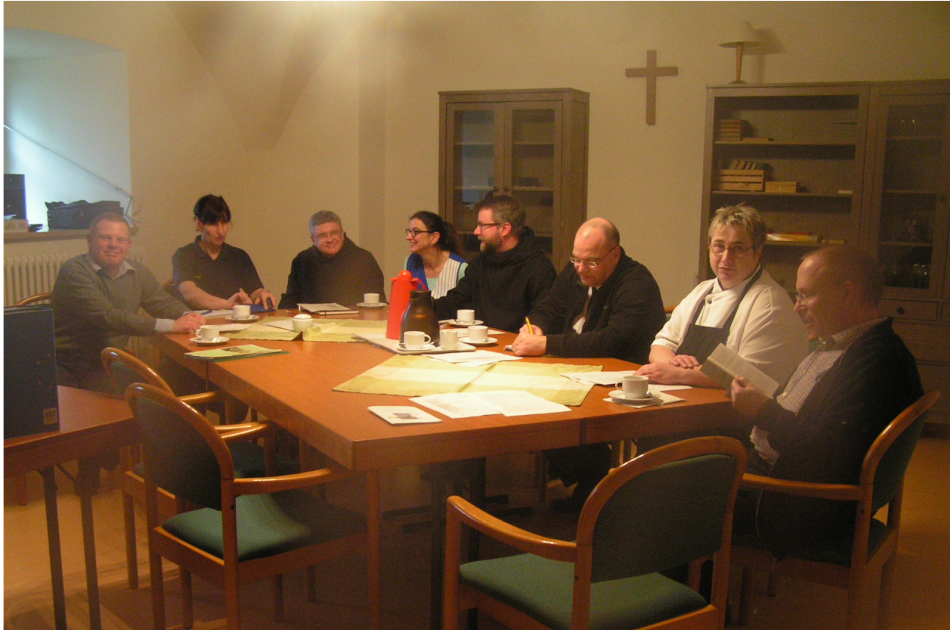
Discussion with the employees of the Huysburg monastery about environmental questions