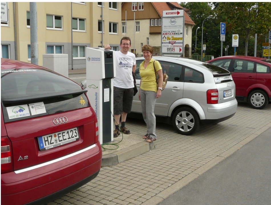
Meeting of three Audi-A2 E-mobilists in Wernigerode / Harz in summer 2011 for a comparison drive.