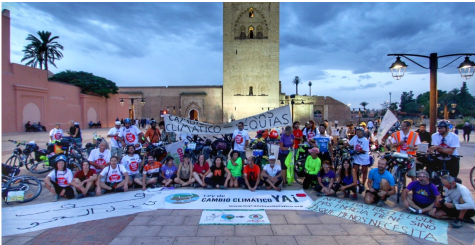
Demonstration in Marrakech